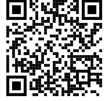
Scan code with the camera app on your phone to open our website!